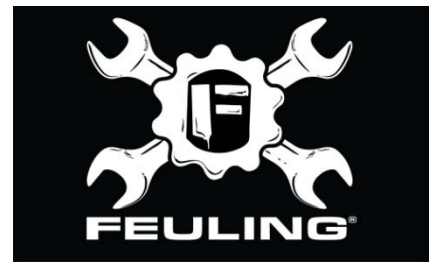
36" X 24" LOGO BANNER