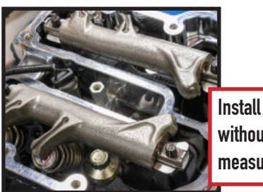
Install rocker arms without pushrods to measure end play