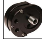
Black Part # 2022