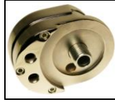
Chrome Part # 2021

FITS '99-'13 TWIN CAM® & EFI EVO ENGINES