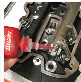
Loctite fine threads.