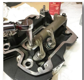
See *NOTE final torque: 24-26 ft/lbs