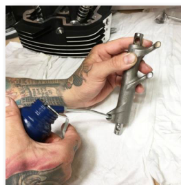
Fill rocker arm with oil.