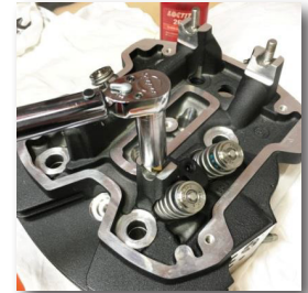
Torque to 5 ft/lbs (48-72 in/lbs)