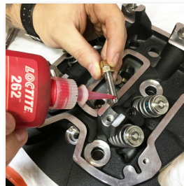
Loctite course threads.

*NOTE: It is important to seat the rocker arm shafts by evenly tightening the nuts to estimated 10 Ft. Lbs. then loosening to allow the shafts to settle in, then re-tighten evenly and step the torque to a final 24 – 26 ft/lbs.