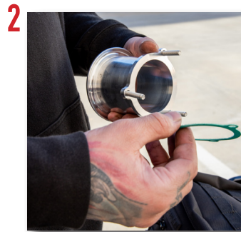
2 INSTALL INCLUDED GASKET & APPLY LOCTITE TO BOLT THREADS.