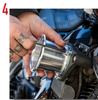
4 EVENLY TIGHTEN & TORQUE BOLTS.