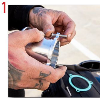
1 PUT BOLTS THROUGH BOLT HOLES.

Impressive HP and TQ gains on engines running modified and ported cylinder heads and intakes with larger throttle bodies. Great performance part for racing and for those that want to head to the track on the weekend. Natural aluminum finish, MADE IN THE USA.