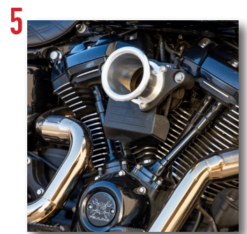
5 RACE READY!