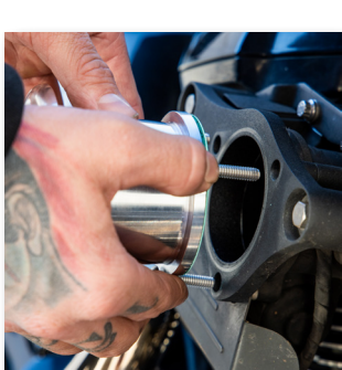
3 ATTACH VELOCITY STACK.