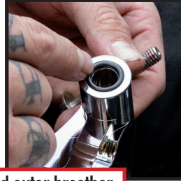
Lube and install inner and outer breather O-rings, use with O-ring lube.